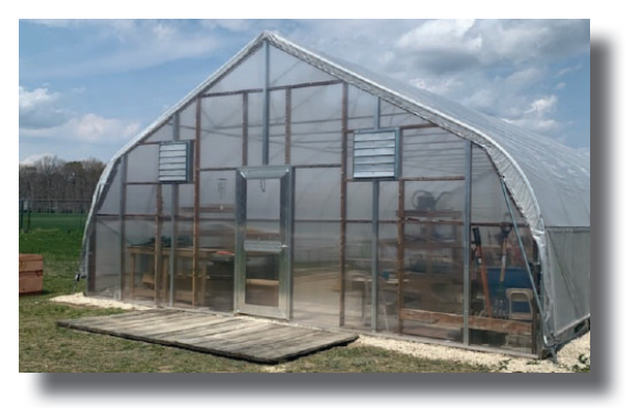
Howell Middle School South Greenhouse, 2021